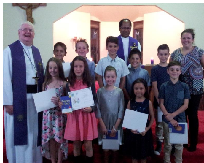
Our Grade 3 students after receiving the Sacrament of Reconciliation